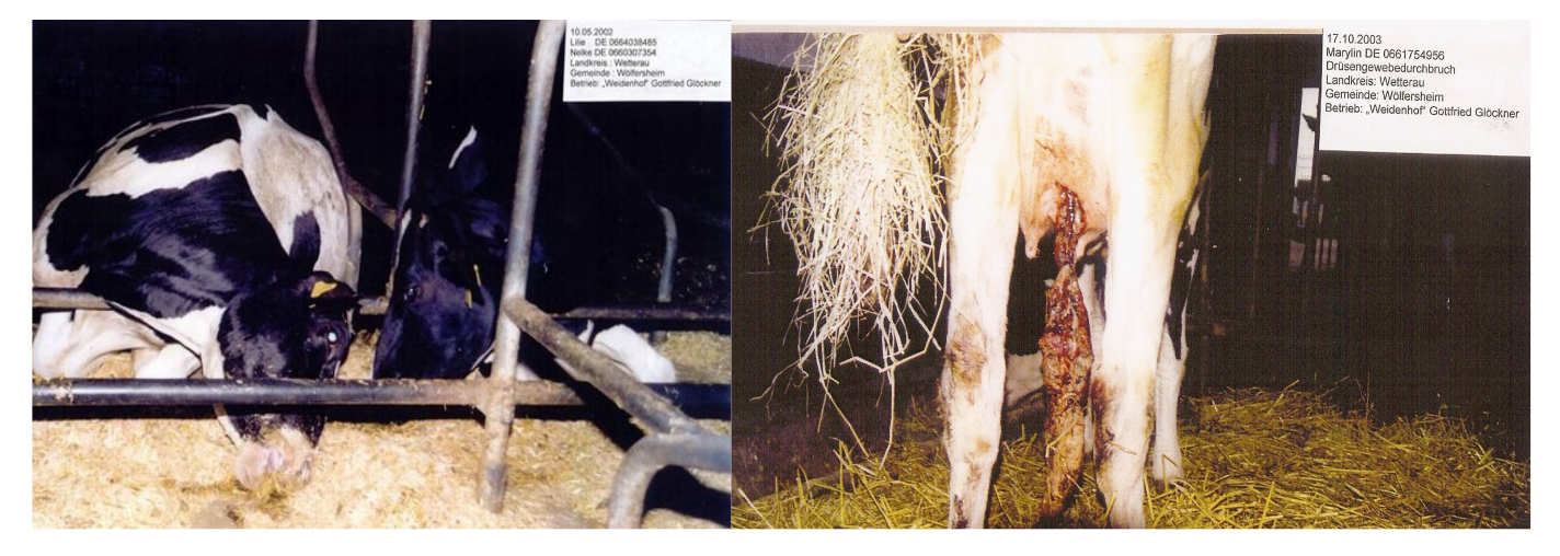
Figure 2 . Characteristic symptoms of the pathology observed. Paresis in animals (on the left, 2002) and mammary gland break (on the right, 2003), epithelial disruptions together with mucosal problems.

level was also normal (8.2 mg/dl). Mg, triglycerides, GLDH, AST and cholesterol were also within the norm. The bilirubin level was low (4 \mu m/l). The plasma glucose level was normal; there were no abnormal or high levels of blood cells in milk, and no viral or bacterial infections. Levels of urea in plasma were 2 times above the norm (around 60 mg/dl); urine ketones were normal but urine Na was again elevated, in general 3–15 times more than the normal upper limit, indicating a kidney leakage. The urinary potassium was half the level of the upper limit.